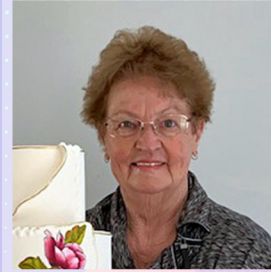
Joy Eagles NSW Stencils