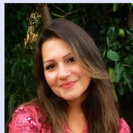
Penny Bunz VIC "Cleopatra Cakes" Novelty Cakes